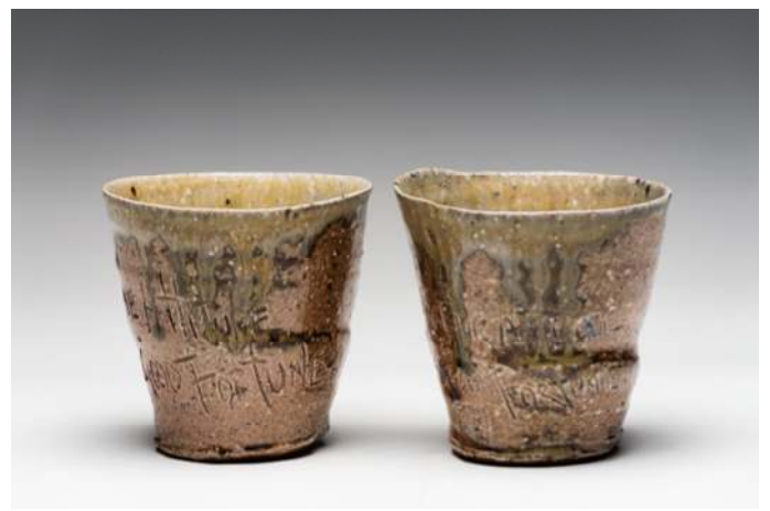
THP2127 A positive attitude invites good fortune 9.5 X 9.5 X 9.5cm .2kg $250