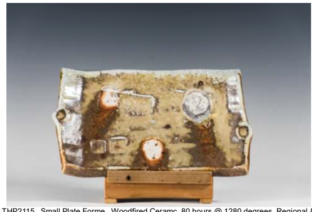
THP2115 Small Plate Forme Woodfired Ceramc, 80 hours @ 1280 degrees. Regional & commercial minerals, slab formed, fired as stack of 2, placed for strong fire effects. Underside gestural gliph suggests marine horizon view from a wheelhouse window. 22.5 X 13 X 2.5cm .63kg $175