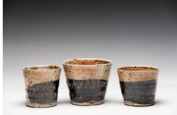
THP2131 God does play dice 8.7 X 7.7 X 7.7cm .16kg A positive attitude invites good fortune 10 X 10 X 8.5cm .2kg Who knows the mind of Heaven & Earth? 8.5 X 8.5 X 7.2cm .16kg $375