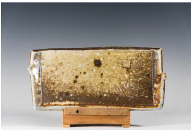
THP2113 Small Plate Forme Woodfired Ceramc, 80 hours @ 1280 degrees. Regional & gliph suggests man & waters edge. 25 X 12 X 3cm .65kg $175