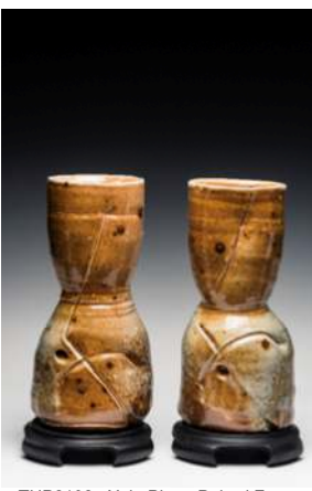
THP2102 Xaio Ping Paired Forme Woodfired Ceramic, 80 hours @ 1280 degrees, Shino type glaze, Ember Mark, Rnd Stand 14 X 14 X 27cm 2.3kg $1750