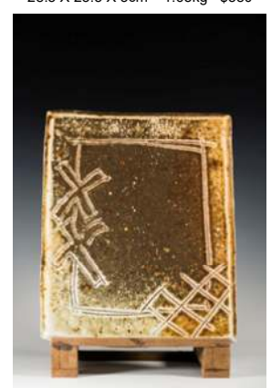
THP2109 Plate Forme Woodfired Ceramc, 80 hours @ 1280 degrees. Regional & commercial minerals, slab formed, stack fired to produce shell marks, gestural gliph suggests River Jenii series minerals, slab formed, stack fired to produce shell marks, gestural gliph suggests marine environs &