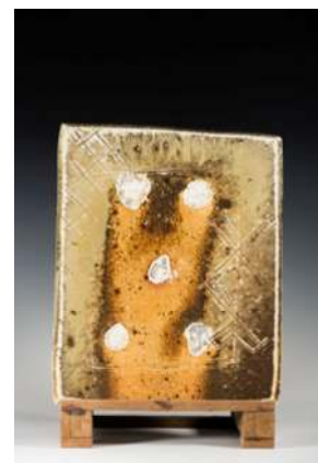
THP2110 Plate Forme Woodfired Ceramo, 80 hours @ 1280 degrees. Regional & commercial minerals, slab formed, stack fired to produce shell marks, gestural gliph suggests tide line & beach