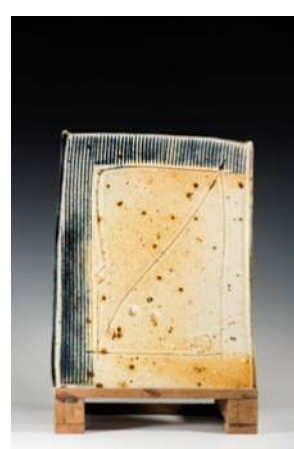
THP2111 Plate Forme Woodfired Ceramc, 80 hours @ 1280 degrees. Regional & commercial minerals, slab formed, gestural gliph suggests River Jenii Kuranda. 29 X 21 X 2.5cm 1.3kg $580