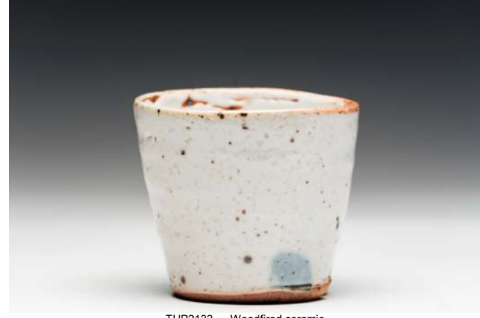
THP2132 Woodfired ceramic 10.3 X 10 X 9.5cm .34kg $95