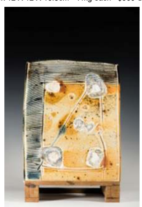
THP2108 Plate Forme Woodfired Ceramc, 80 hours @ 1280 degrees. Regional & commercial