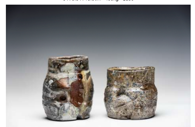
THP2124 Wee Voco Woodfired Ceramic, 80 hours @ 1280 degrees, mixed regional & commercial minerals. Placed in midden & exposed fire environs. Marks suggest Yin Tao Guong ideals & Jenii spirit hidden within the vessel. 10 X 9 X 13.5cm .68kg 10 X 11.5 X 11cm .63kg $650