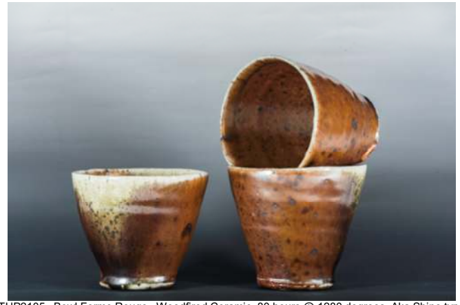
THP2105 Bowl Forme Rouge Woodfired Ceramic, 80 hours @ 1280 degrees, Aka Shino type glaze & fire mark. Forme evolves from Hindi/Jain tea vessel of ancient origins & in use today. Approx 12 X 12 X 10.5cm .4kg each $900 Set of 3