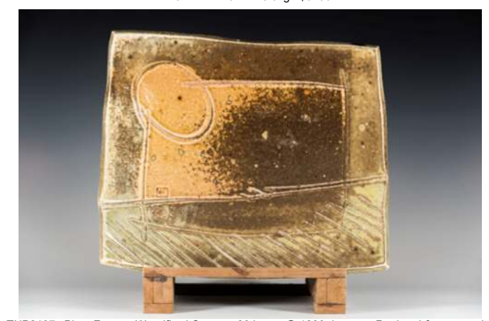
THP2107 Plate Forme Woodfired Ceramc, 80 hours @ 1280 degrees. Regional & commercial minerals, slab formed, gestural gliph suggests marine horizon & headland. 29 X 21 X 2.5cm 1.52kg $580