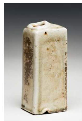
THP2121 Vasiforme Vessel for single stem fleur, porcelianous, fire patina on Shino glaze, 6\,X\,5.5\,X\,15.5\text{cm} .63kg $280