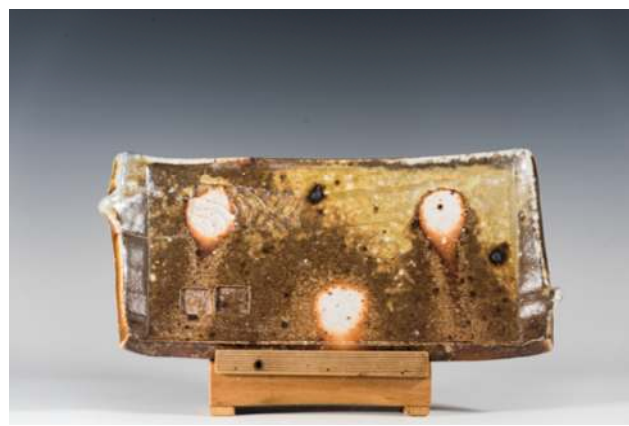
THP2112 Small Plate Forme Woodfired Ceramc, 80 hours @ 1280 degrees. Regional & commercial minerals, slab formed, fired as stack of 2, sheltered zone to make milder patina. Gestural commercial minerals, slab formed, fired as stack of 2, sheltered zone to make milder patina. Gestural gliph suggests man & waters edge. 23 X 12.5 X 3.5cm .58kg $175