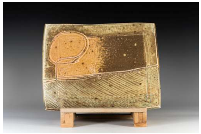
THP2106 Plate Forme Woodfired Ceramc, 80 hours @ 1280 degrees. Regional & commercial minerals, slab formed, gestural gliph suggests marine view eastward 28.5 X 23.5 X 3cm 1.65kg $580