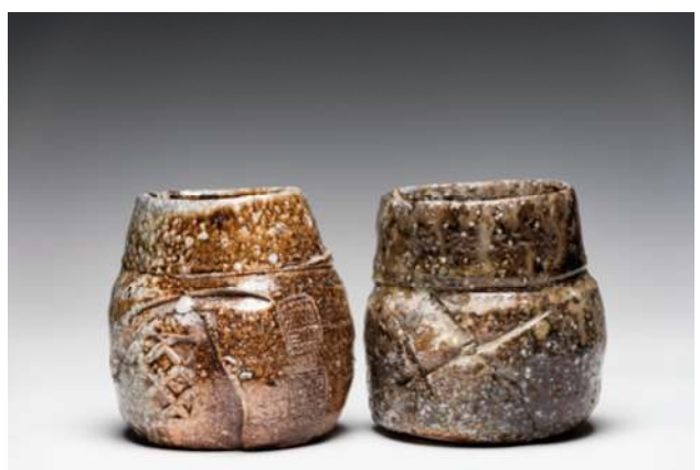
THP2122 Wee Voco Woodfired Ceramic, 80 hours @ 1280 degrees, mixed regional & commercial minerals. Placed in midden & exposed fire environs. Marks suggest Yin Tao Guong ideals & Jenii spirit hidden within the vessel. 11 X 11 X 12cm . 68kg $625