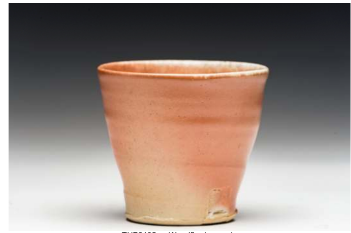
THP2135 Woodfired ceramic 10.3 X 10 X 9.5cm .34kg $120