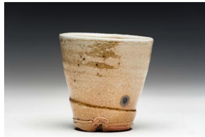
THP2138 Woodfired ceramic 10.3 X 10 X 9.5cm .34kg $95