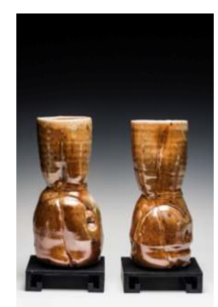
THP2101 Xiao Ping Paired Forme Woodfired Ceramic, 80 hours @ 1280 degrees, Shino type glaze Ash Mark square stand 14 X 14 X 27cm 1.49kg $1750