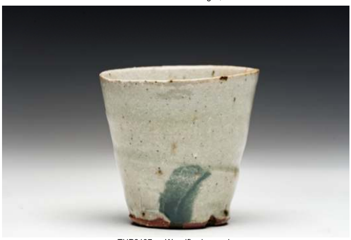
THP2137 Woodfired ceramic 10.3 X 10 X 9.5cm .34kg $100