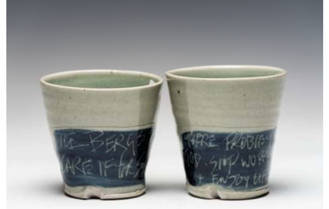
THP2130 Icebergs don't care if the ship sinks There's probably no God, stop worrying & enjoy life 9.7 X 9.7 X 9.3cm .27kg $225