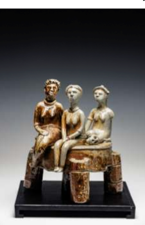
THP2140 Morning Star & Pish Marrie Group of maritime jeniis, materialise with an EOS event to spook Nantrang Phantom's Bleu, to root them and eat the children. 20 X 20 X 27 cm 3.4kg $1850 THP2141 Nan Trang Phantoms East Asian fishing poachers, work for China & PNG agents. Gulf of Papua, Coral Sea. Lamer Coral Series, Woodfired Ceramic 23 X 12 X 14.5cm 2.4kg $1650