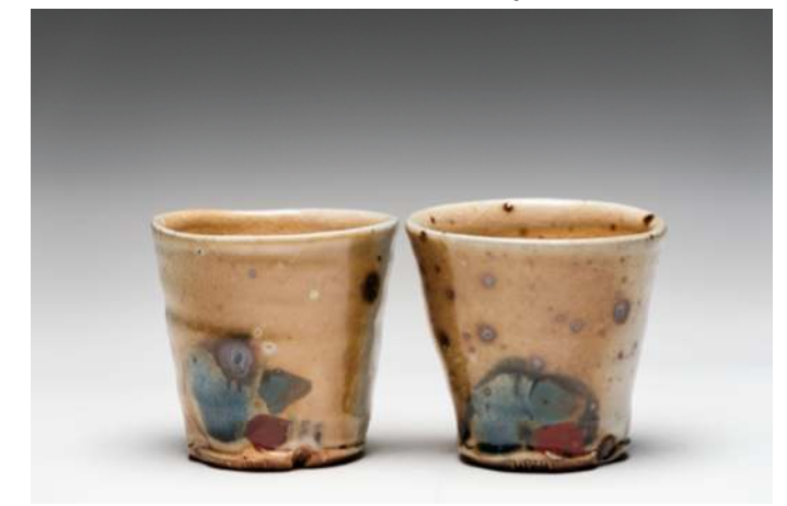
THP2129 Woodfired Ceramic, 80 hours @1280 degrees, Shino type glaze, colour mark mixed 8.7 X 8.7 X 8.3 cm .22kg $275