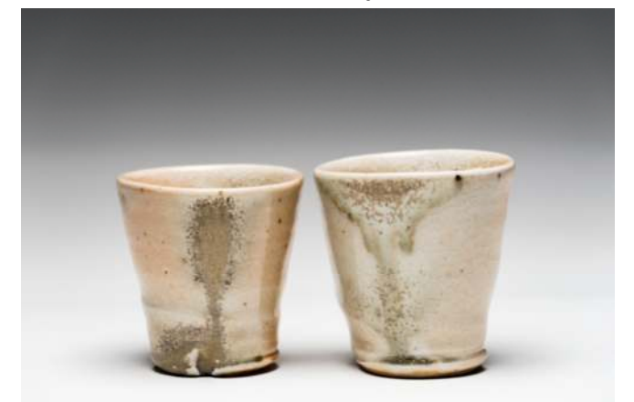
THP2128 Paired Forme Woodfired Ceramic, 80 hours @1280 degrees, Shino type glaze, colour mark bleu 8.5 X 8 X 9cm .22kg $275