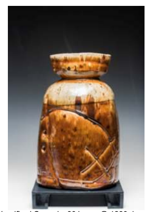
THP2104 Voco Yin Tao Woodfired Ceramic, 80 hours @ 1280 degrees, coiled and thrown vessel with regional raw materials, Shino type glaze. Placed to fire weather block extreme. Gestural glyph suggests Yin Tao Guong ideals. 25 X 22 X 43cm 8.3kg $3250