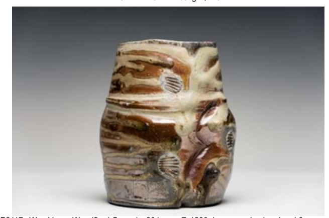
THP2117 Wee Voco Woodfired Ceramic, 80 hours @ 1280 degrees, mixed regional & commercial minerals. Placed in midden & exposed fire environs. Marks suggest Yin Tao Guong ideals & Jenii spirit hidden within the vessel. 12 X 12 X 16cm .82kg $575