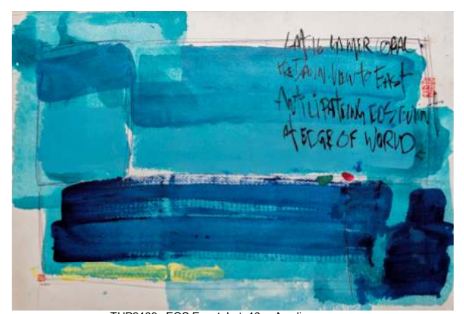
THP2139 EOS Event, Lat: 16s Acrylic on paper Lat 16s. Lamer coral pre-dawn view to east anticipating EOS event at edge of world 77 X 52cm $1144