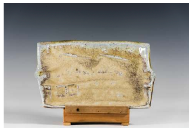
THP2114 Small Plate Forme Woodfired Ceramc, 80 hours @ 1280 degrees. Regional & commercial minerals, slab formed, fired as stack of 2, sheltered zone to make milder patina, Gestural gliph suggests man & waters edge. 22.5 X 13 X 2.5cm .63kg $175