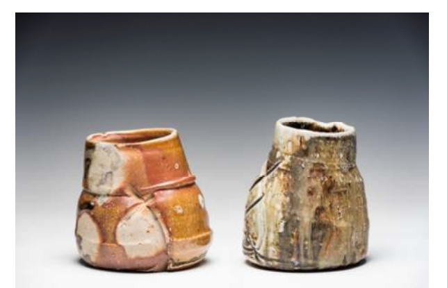
THP2123 Wee Voco Woodfired Ceramic, 80 hours @ 1280 degrees, mixed regional & commercial minerals. Placed in midden & exposed fire environs. Marks suggest Yin Tao Guong ideals & Jenii spirit hidden within the vessel. 13.5 X 12 X 13.5cm . 99kg