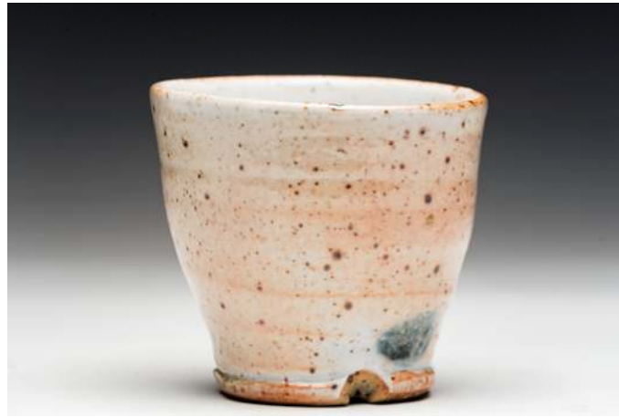
THP2133 Woodfired ceramic 10.3 X 10 X 9.5cm .34kg $95