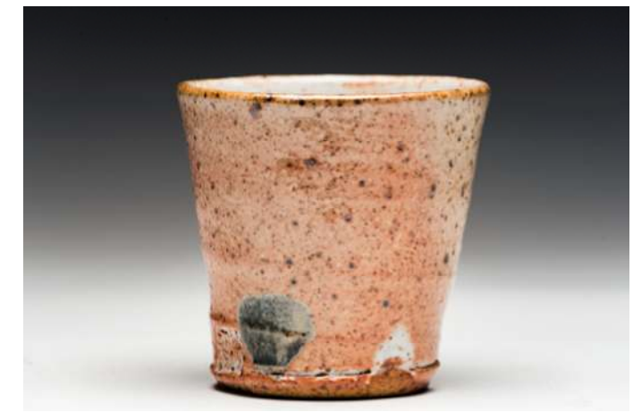
THP2136 Woodfired ceramic 10.3 X 10 X 9.5cm .34kg $125